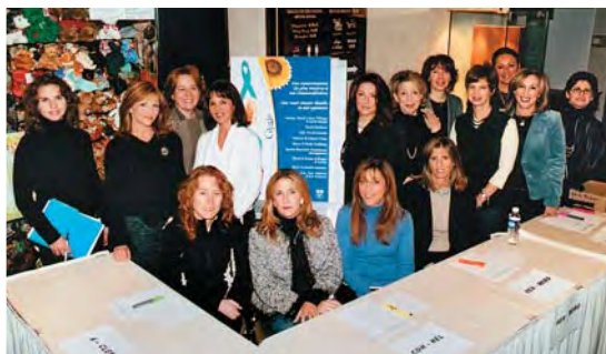
"What You Need to Know About Ovarian Cancer" Organizing Committee.