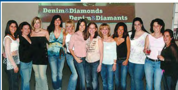
Young Adult Division Denim & Diamonds Committee.