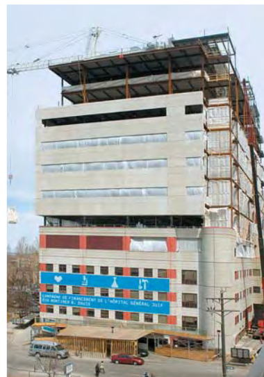
The ongoing construction of Cummings Pavilion E.