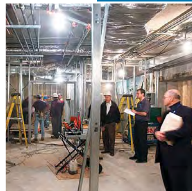
Building the new Nuclear Medicine Facility.