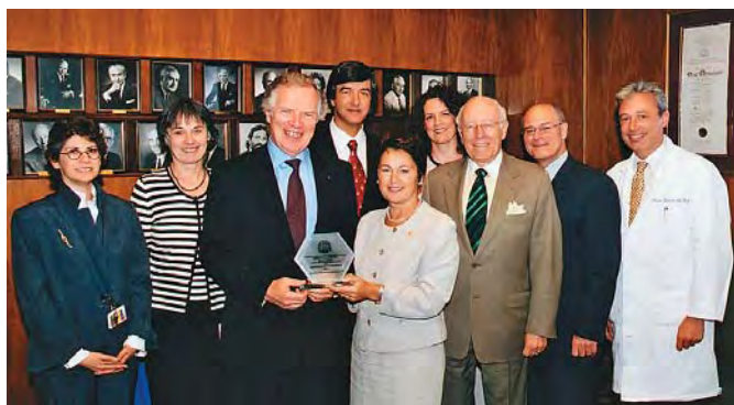
SNC Lavalin Recognition.