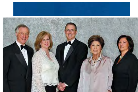
2 nd Casino Royale and Auction.