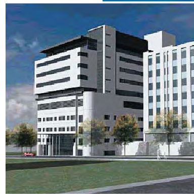
Artist's view of the expanded Cummings Pavilion E.

In closing, we would like to once again thank our remarkable donors and devoted volunteers for their continued generosity and support. The Hospital's 23,000 inpatients, 60,000 plus Emergency patients and recipients of over 500,000 outpatient services, are the beneficiaries of their efforts throughout the year. We look forward to our ongoing and productive partnership. Together, we will make a difference for our community, our city and our province.